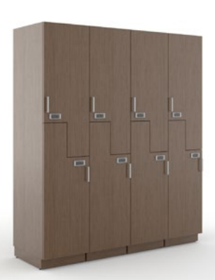
Storage locker with Z doors