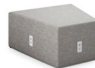
Trapezoid with power and glides