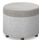
Round with removable lid and wood legs