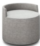
Round with low back and active base