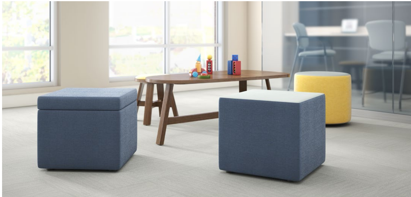
Boost+ ottomans with Cascade occasional tables with Heidi stool by OFS