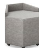
Hexagon with low back and casters