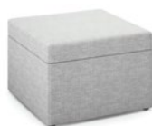
Square with removable lid and glides