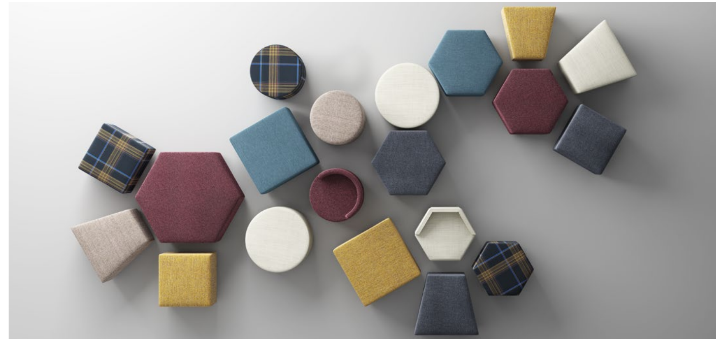
Boost+ various shapes and sizes