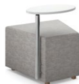
Trapezoid with tablet and wood legs