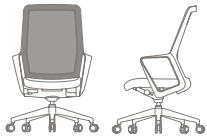
High back 16016 w25" d24.5" h40-43.75"