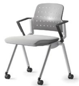
Multi-use with arms and plastic back