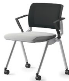
Multi-use with arms and mesh back