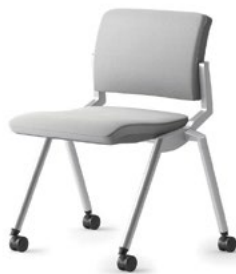
Multi-use, armless with upholstered back