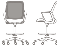
Mid back stool 16055 w25" d24.5" h42.25-52.25"