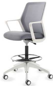
Mid back stool