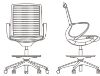
Mesh shell bar height