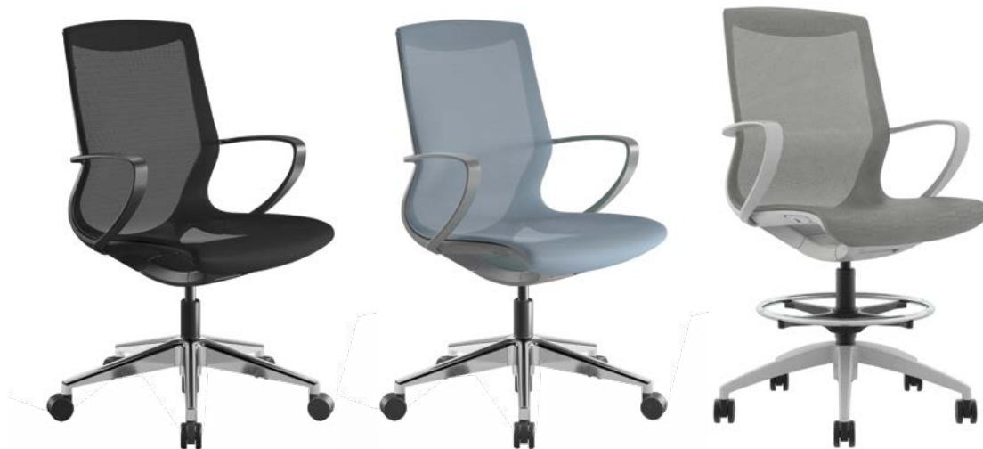
Mesh shell in Raven with Carbon frame and polished aluminum base