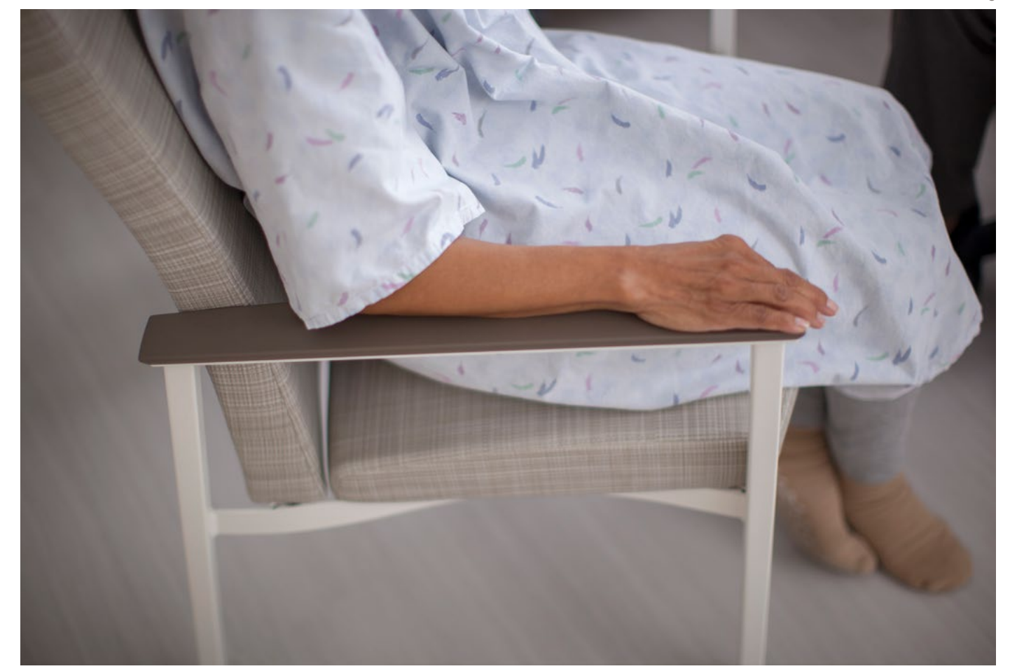
Serony patient seating with bone white powder coat and taupe poly arm caps