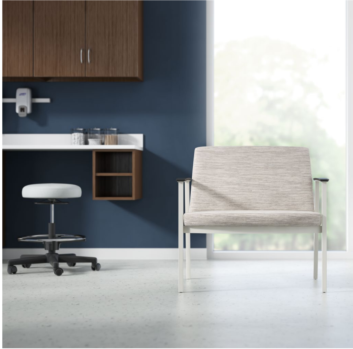
Serony bariatric seating with exam stool and Mile Marker casegoods