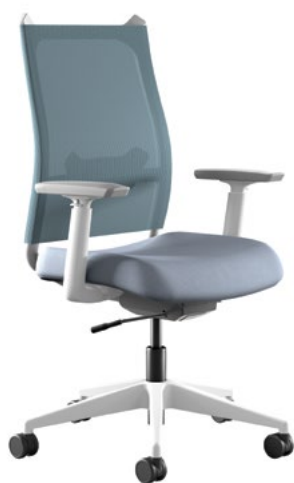
Task chair with 4D pivoting arms and chalk nylon base