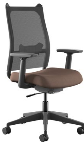
Task chair with 4D pivoting arms and carbon nylon base