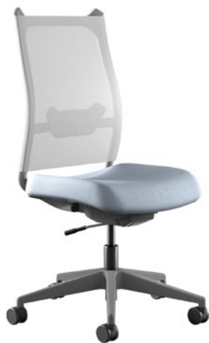
Task chair, armless with graphite nylon base