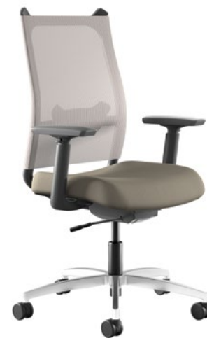
Task chair with 4D pivoting arms and polished aluminum base