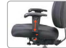
A5HD 4-WAY ADJUSTABLE