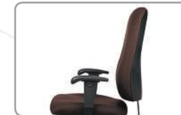
BN2 - GRADE B AND UP UPHOLSTERED OUTER BACK IN BLACK BALLISTIC NYLON