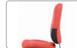
BNP1 LOWER PORTION OF THE BACKREST SURFACE IN BLACK BALLISTIC NYLON