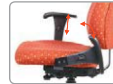
A90 2-WAY ADJUSTABLE BREAKAWAY ARMS