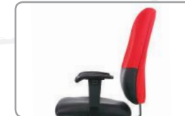
BNP2 LOWER PORTION OF THE BACKREST SURFACE AND FULL SEAT IN BLACK BALLISTIC NYLON