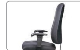
BN1 - GRADE A ONLY UPHOLSTERED OUTER BACK IN BLACK BALLISTIC NYLON