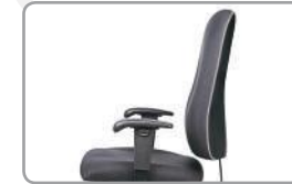
EP EDGE PROTECTOR - CLEAR VINYL TUBE PLACED AROUND THE EDGE OF THE BACK OF THE SEAT