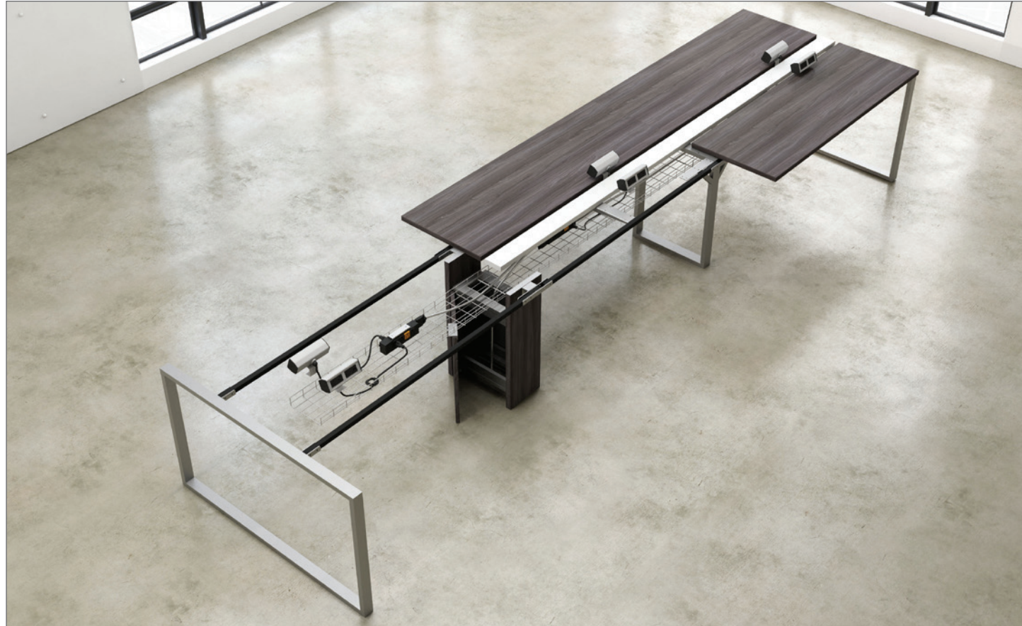
Steel beams running between the support legs give lateral strength to the bench while supporting the worksurfaces. Steel or laminate intermediate legs can be used to provide support for longer runs. The 8-wire, 4-circuit electrical can be placed in the wire basket under the worksurfaces.

Synapse offers multiple solutions for bringing power and data to workstations