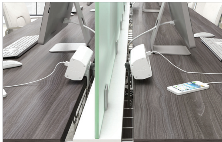
Power can easily be brought to the worksurface allowing users the option to plug in above or below the worksurface.