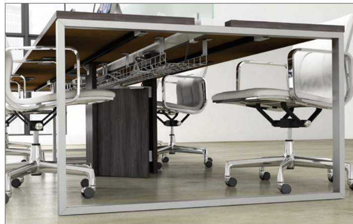
The wire basket can be easily disconnected in order to place power cords, power bricks, or other peripherals.