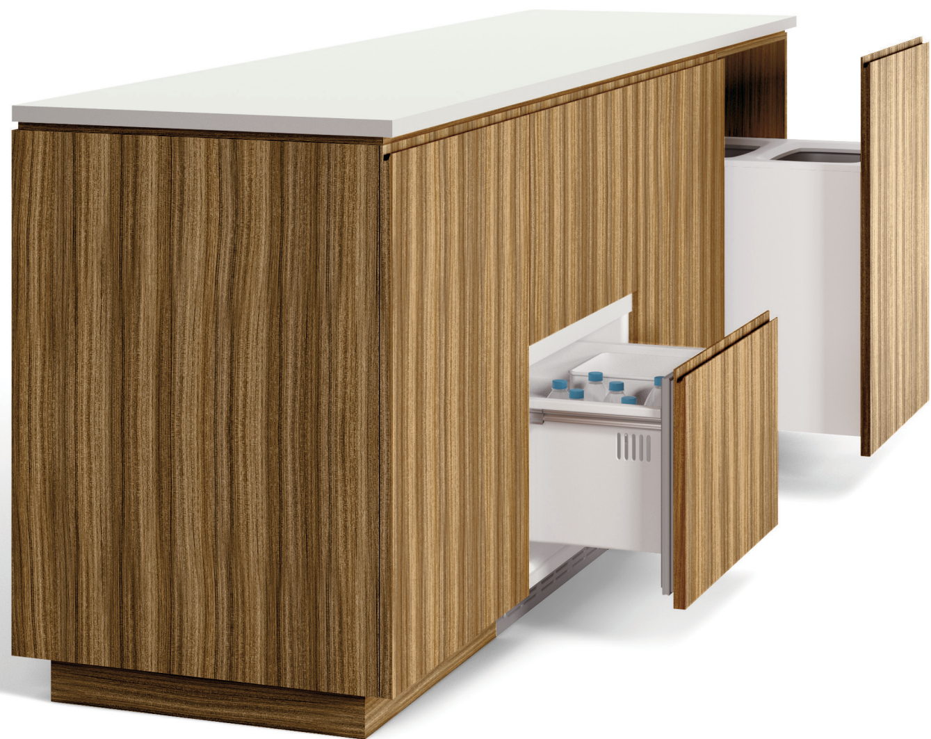
Above: 96" utility credenza with top and bottom refrigerator drawer fronts, front trash/recycling unit. Shown in Natural Paldao with solid surface Designer White top and integrated pull.