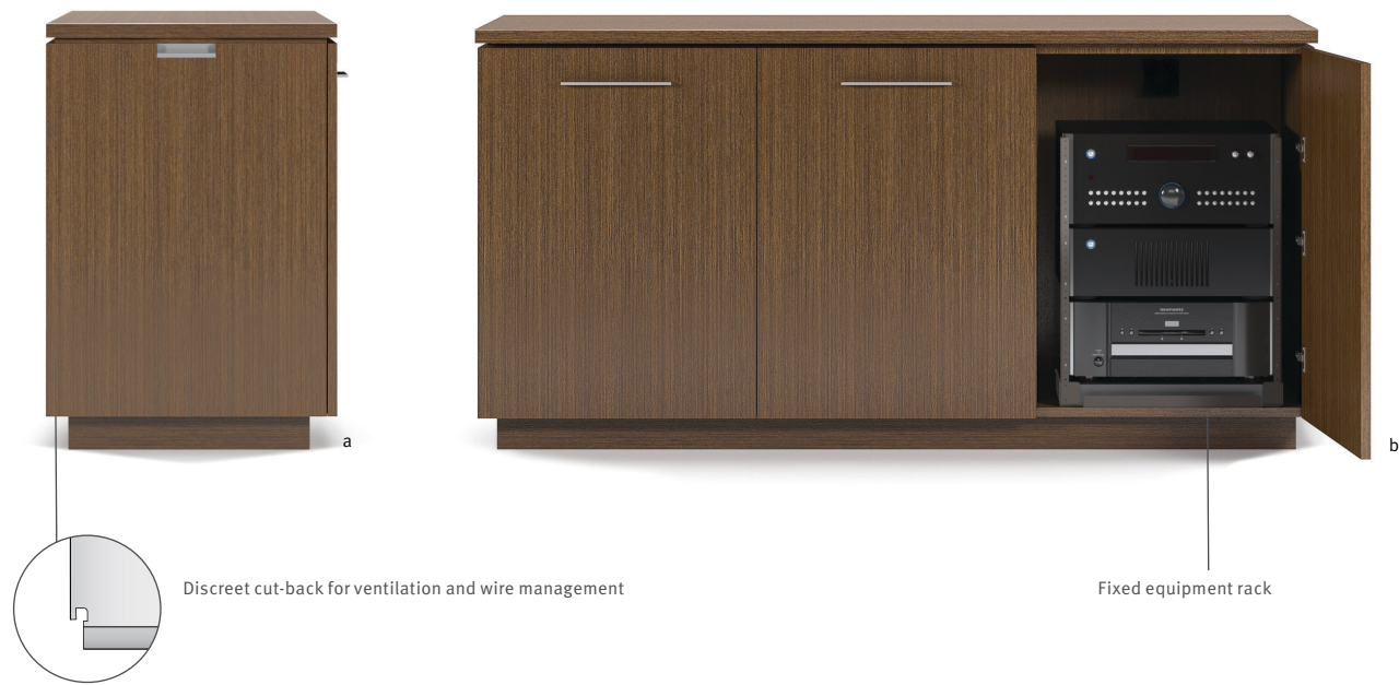
Discreet cut-back for ventilation and wire management