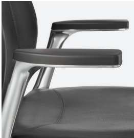
Urethane arm cap

Choose between the less formal urethane arm caps, or the more tailored upholstered arm caps.