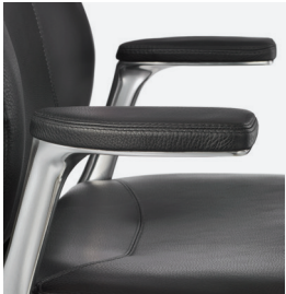
Upholstered arm cap

Adjustable arms that move up and down and pivot are available.