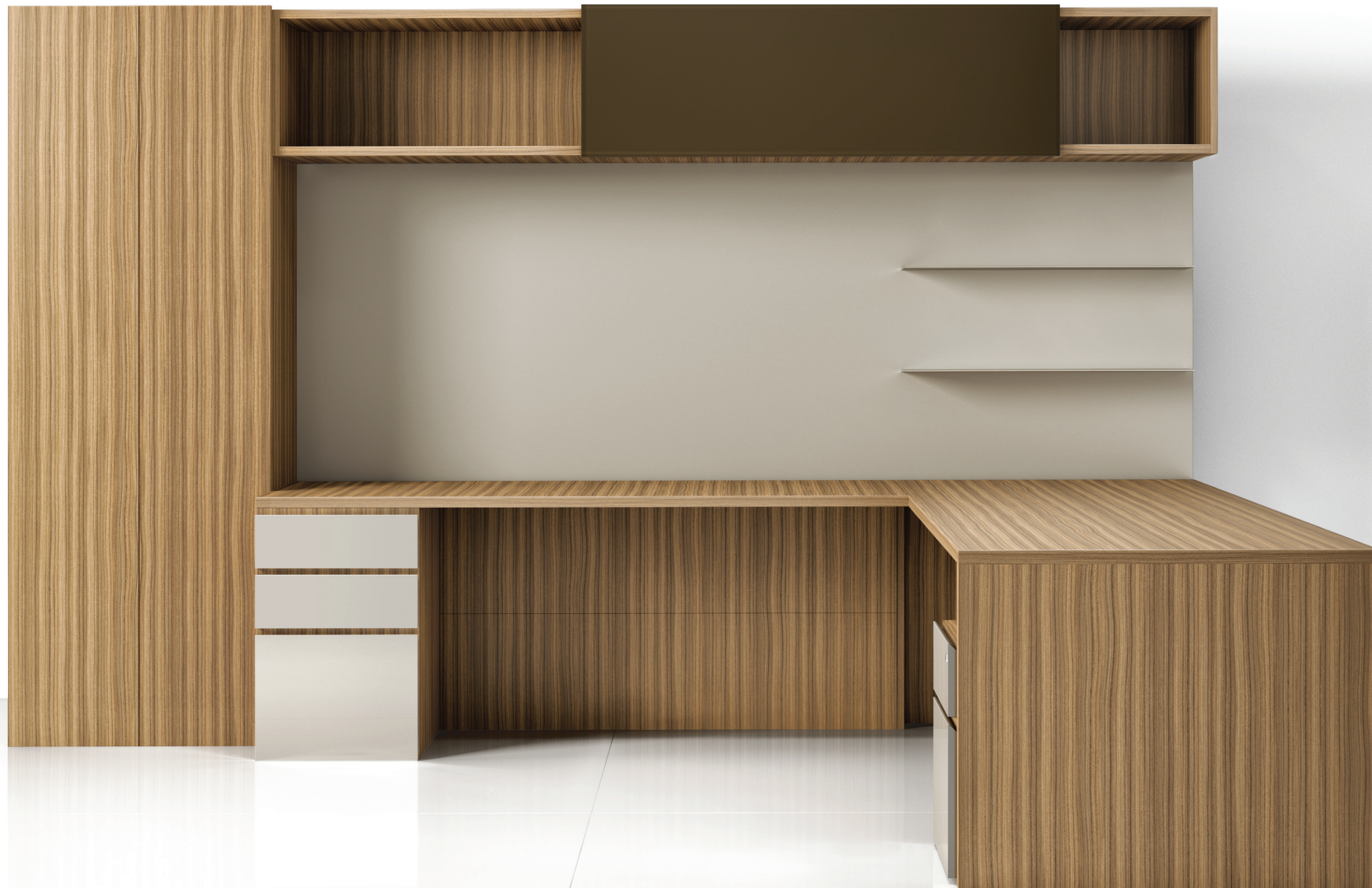
CAMBIUM L-SHAPE Cambium supports both individual focus time and collaboration within the same workspace with an array of tables and workspaces. Above: L-shape casegood configuration shown in Natural Paldao | painted back panel shown in Moonlight paint | display shelves shown in clear anodized metal | overhead shown in Natural Paldao and Clove gloss backpainted glass | pedestal with integrated pull shown in Moonlight paint and Natural Paldao | Meeting table shown in Clove gloss backpainted glass and Aged Bronze powder coat subtop with polished chrome base.