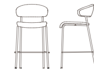
Bar stool 104058 w22.25" d22.5" h40"