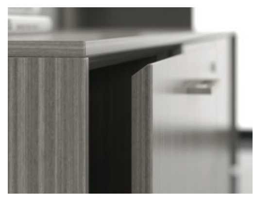
BEVELED DETAIL Latitude's worksurface tops and drawers both have a beveled edge allowing the two to meet at a unique 45° miter.