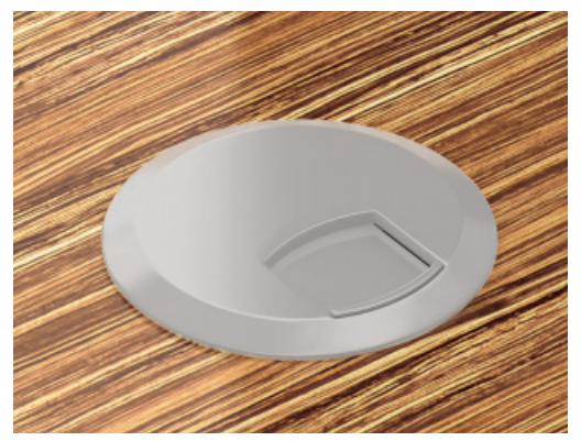
ROUND GROMMETS Round grommets provide convenient cable passage for areas not requiring a large opening.

A unique worksurface mounted module that can be specified to a location that best serves the user's needs.