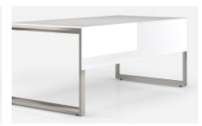
"O" Base with half glass modesty panel