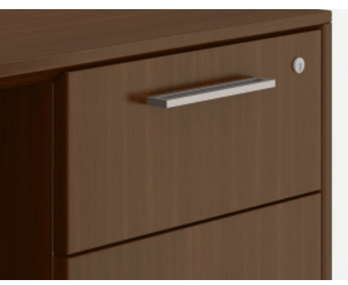
DRAWER PULLS Latitude drawer pulls are Gloss Aluminum finish.

FINGER PULLS Latitude drawers have the option of finger pulls in the same finish as the drawer front.