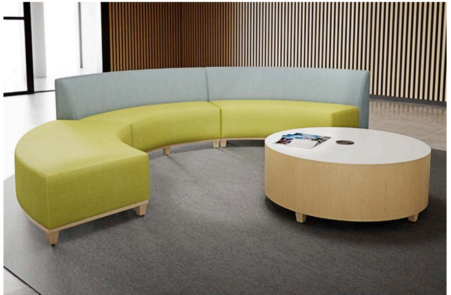
Round Table with Solid Surface Top & P-16R Power Module