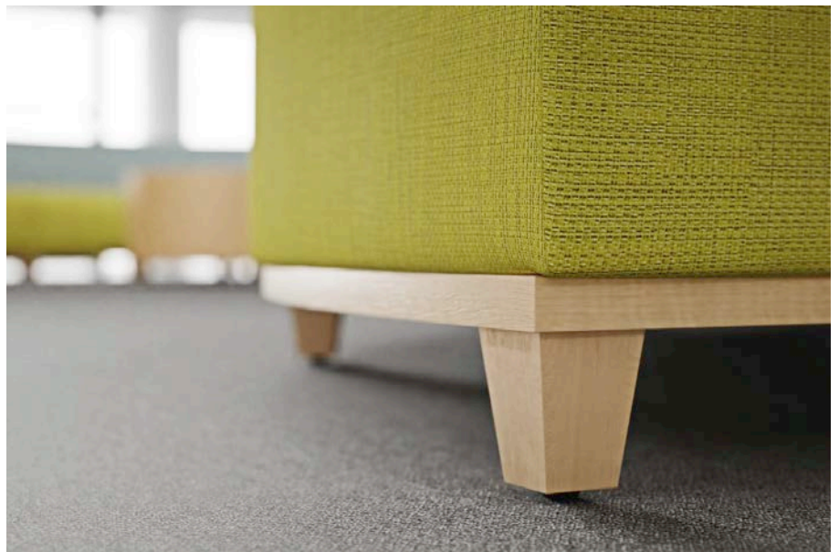
Wood Plinth Base with Solid Wood Feet