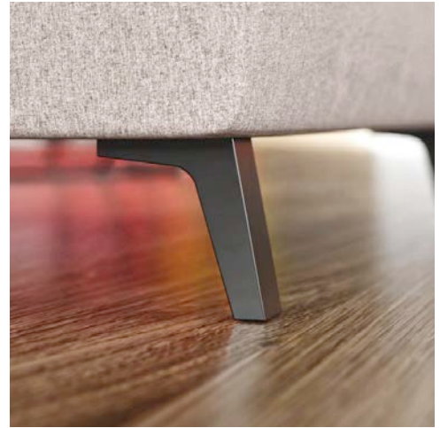
Kenzie Modern Black Metal Leg