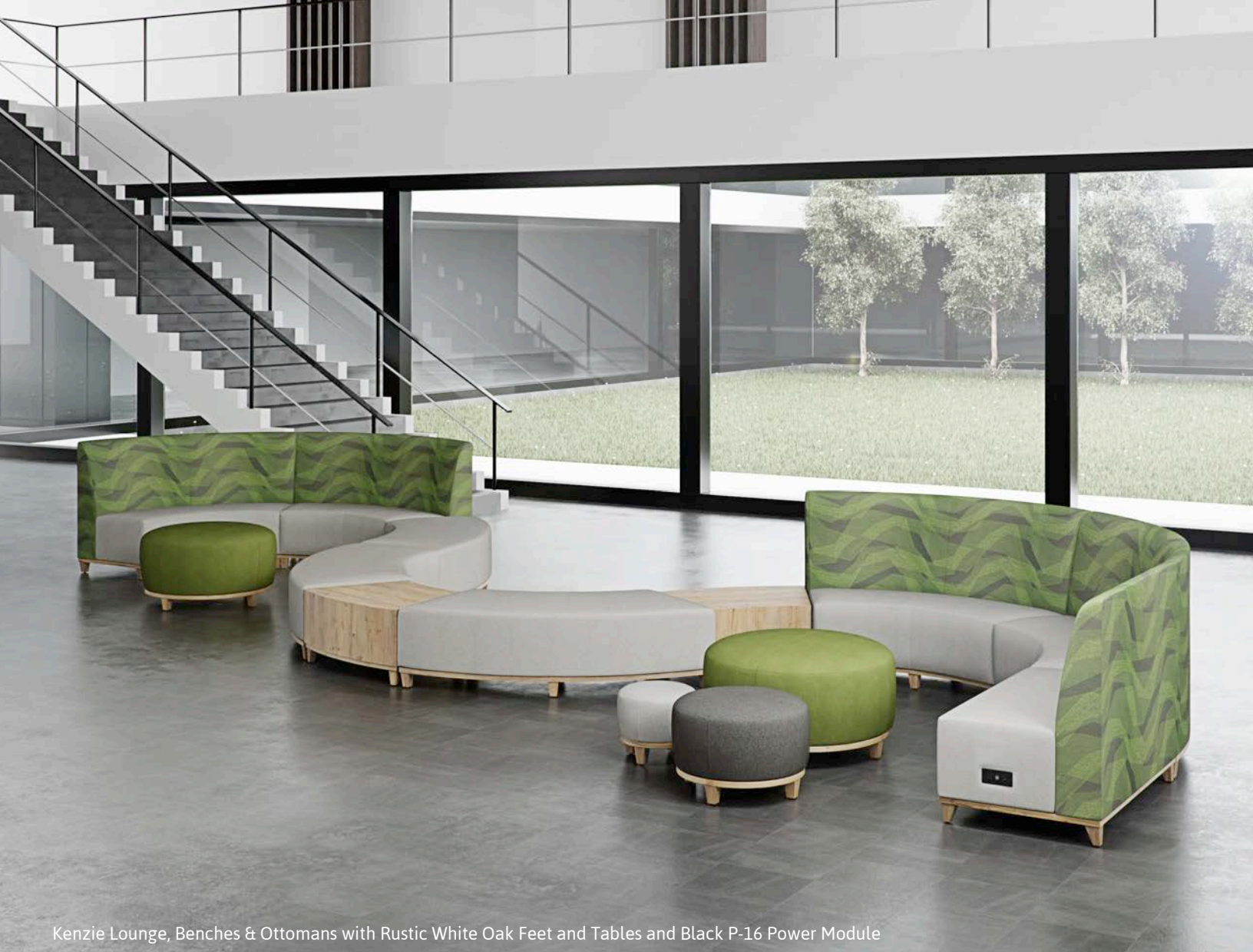
Kenzie Lounge, Benches & Ottomans with Rustic White Oak Feet and Tables and Black P-16 Power Module

At Coriander Designs, we are PROUD to manufacture all our products in America. Since 1979, Coriander Designs' business model of keeping its manufacturing in the USA has resulted in a smaller eco-footprint, local job creation and long term manufacturing stability. At our Woodinville, Washington headquarters, we are able to be flexible in our product offerings, thus meeting the customers needs efficiently and effectively. We have total control over materials that allows for the assurance of the highest quality.