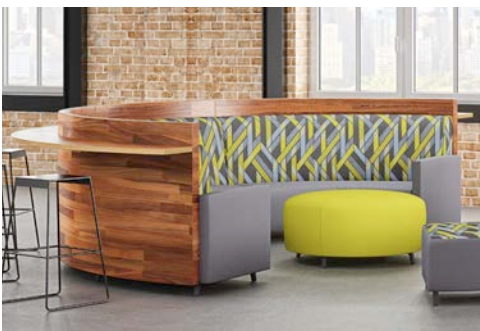
Privacy Panel with Counter Height Surface