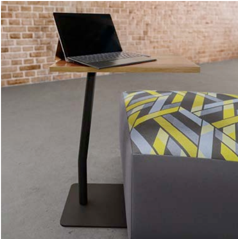
Kenzie Rectangular Laptop Table