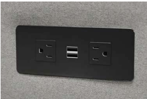
P16 Power Module

Kenzie Modular Seating defines any space as a large sweeping curved unit or as a collaborative area. Kenzie combines craftsmanship with quality construction. The curved lines of these tailored lounge pieces are well complemented by six different ottoman choices.