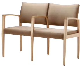
> 2-SEATER #4712 > TANDEM > PARTIAL BACK