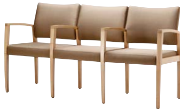
> 3-SEATER #4713 > TANDEM > PARTIAL BACK