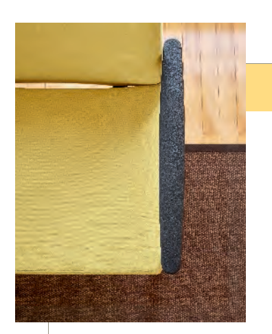
Clean-outs on every side featured on all seating models.