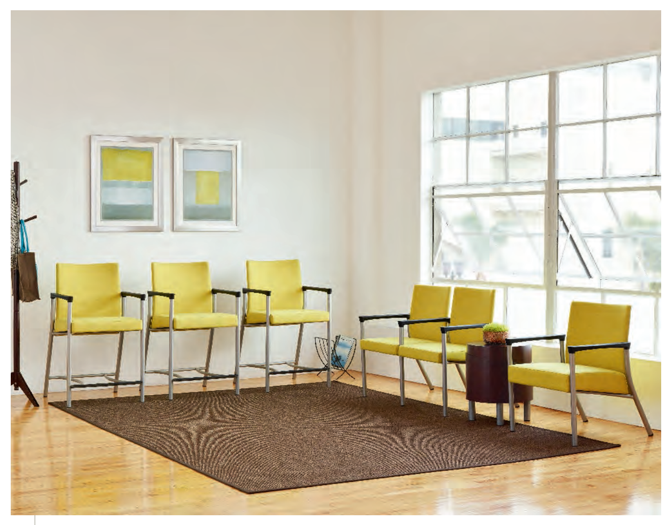
#4457-U Hip Chair, #4410-2-U Two-Seat Tandem and #4461-U Lounge Chair with #440-1820 Soleil Round Table