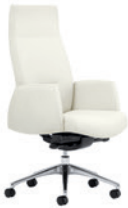
> HIGH BACK #1696 > SYNCHRO-TILT MECHANISM > POLISHED ALUMINUM BASE