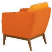
> LOUNGE #5301 > ARMS

A dramatic upholstered frame signals the arrival of Ovate, an eloquent collection of arm and armless lounge, love seat and sofa models that appeal to contemporary and transitional settings alike. Atop an elegant wood platform base – a signature design detail echoed in its bench and occasional table counterparts – Ovate stands up, and stands out, from the crowd.