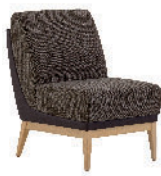
> LOUNGE #5311 > ARMLESS