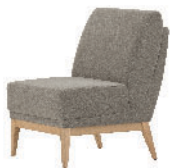
> LOUNGE #5311 > ARMLESS