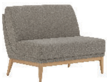
> LOVE SEAT #5312 > ARMLESS