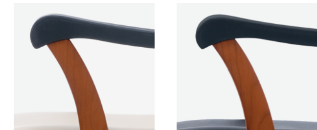
Wood and Polyurethane Wood and Upholstered

Two width sizes and two back heights offer great versatility: from larger to smaller user, from private office to meeting room workstation. As the workplace requires increasingly more flexibility, a chair that can be used in many ways is a good investment. Cadence guest is a comfortable companion to the series. Cherry and Maple hardwoods in the arms and base, as well as upholstered arms, are an elegant enhancement to Cadence. Black urethane arms (with the option of height and width adjustability) and a black nylon base provide attractive functionality and durability. Krug offers an attractive selection of in-stock fabric and leathers, and Cadence can also be upholstered in any other selected textile.