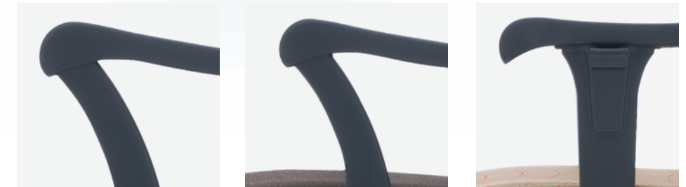
Completely Upholstered Polyurethane Adjustable