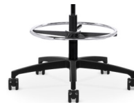
← Each base can pair with a stool kit/foot ring.