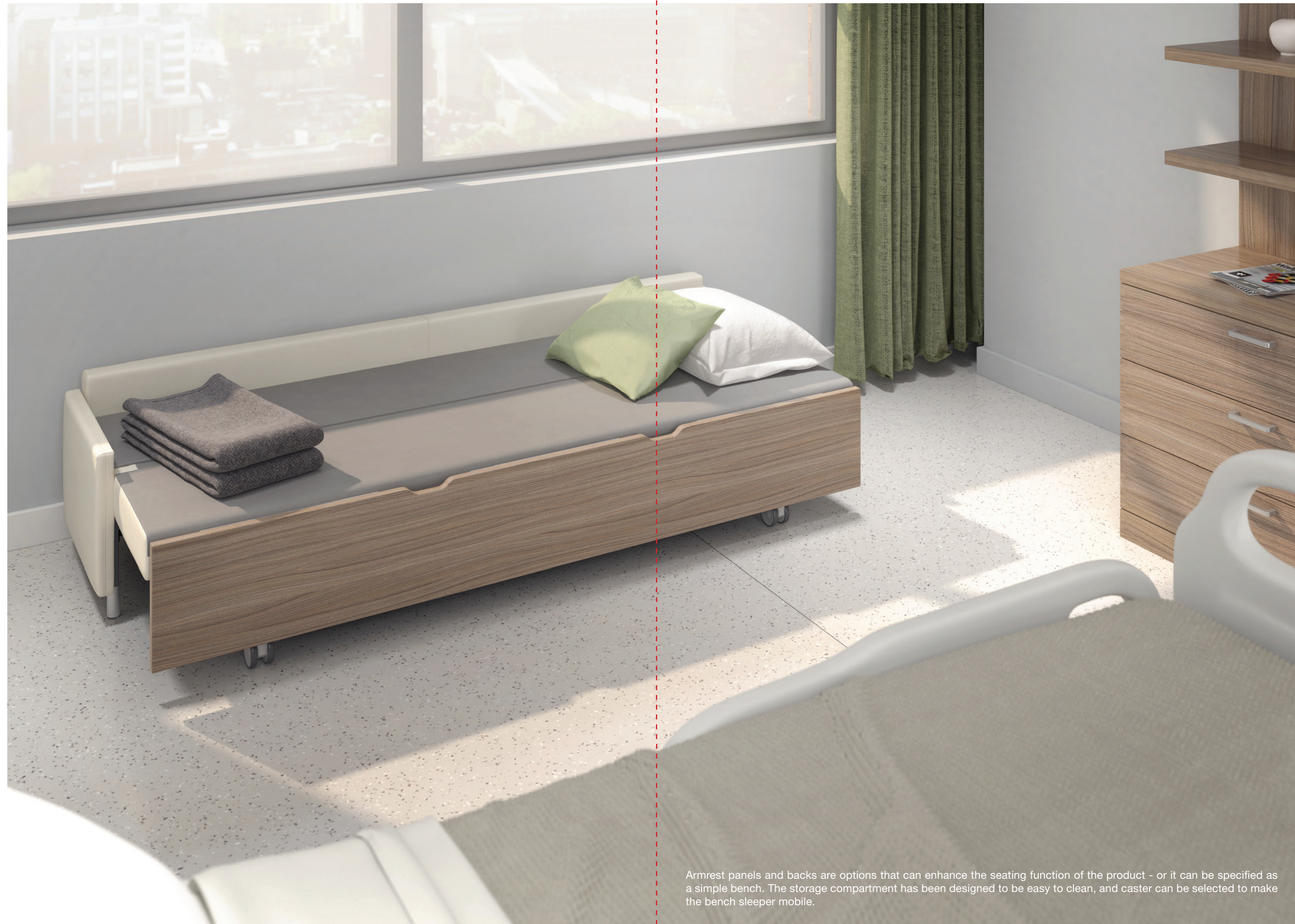
Armrest panels and backs are options that can enhance the seating function of the product - or it can be specified as a simple bench. The storage compartment has been designed to be easy to clean, and caster can be selected to make the bench sleeper mobile.