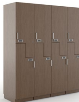
Storage locker with Z doors