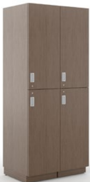
2 Door storage locker