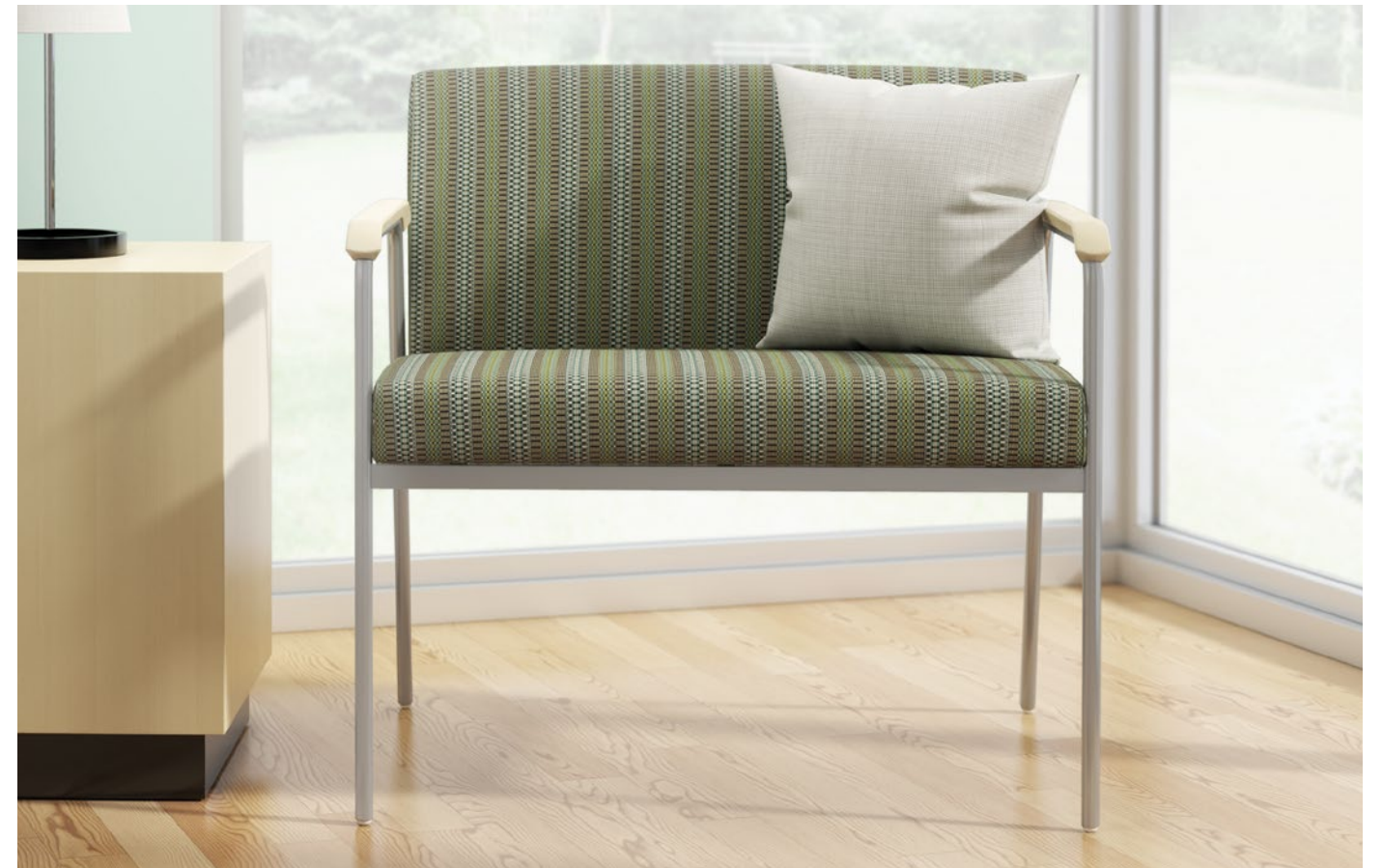
Rule of three bariatric seating with wood arm caps and X&O occasional tables