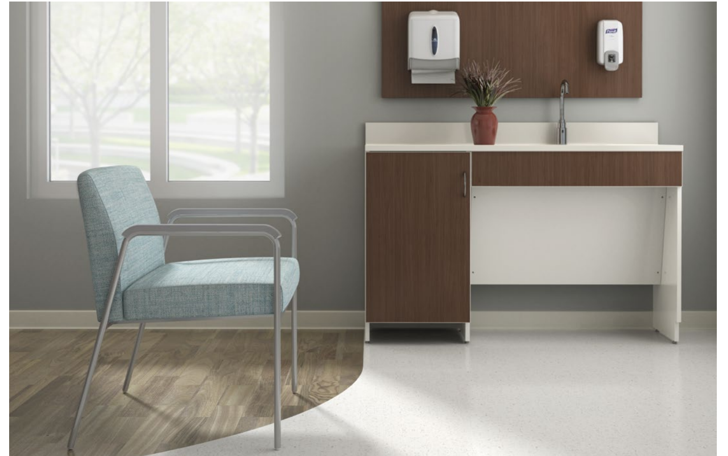
Rule of Three guest seating with folkstone grey resin arm caps