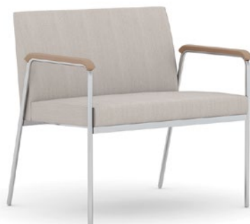
Wood arm cap