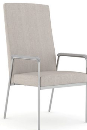
Folkstone grey resin arm cap