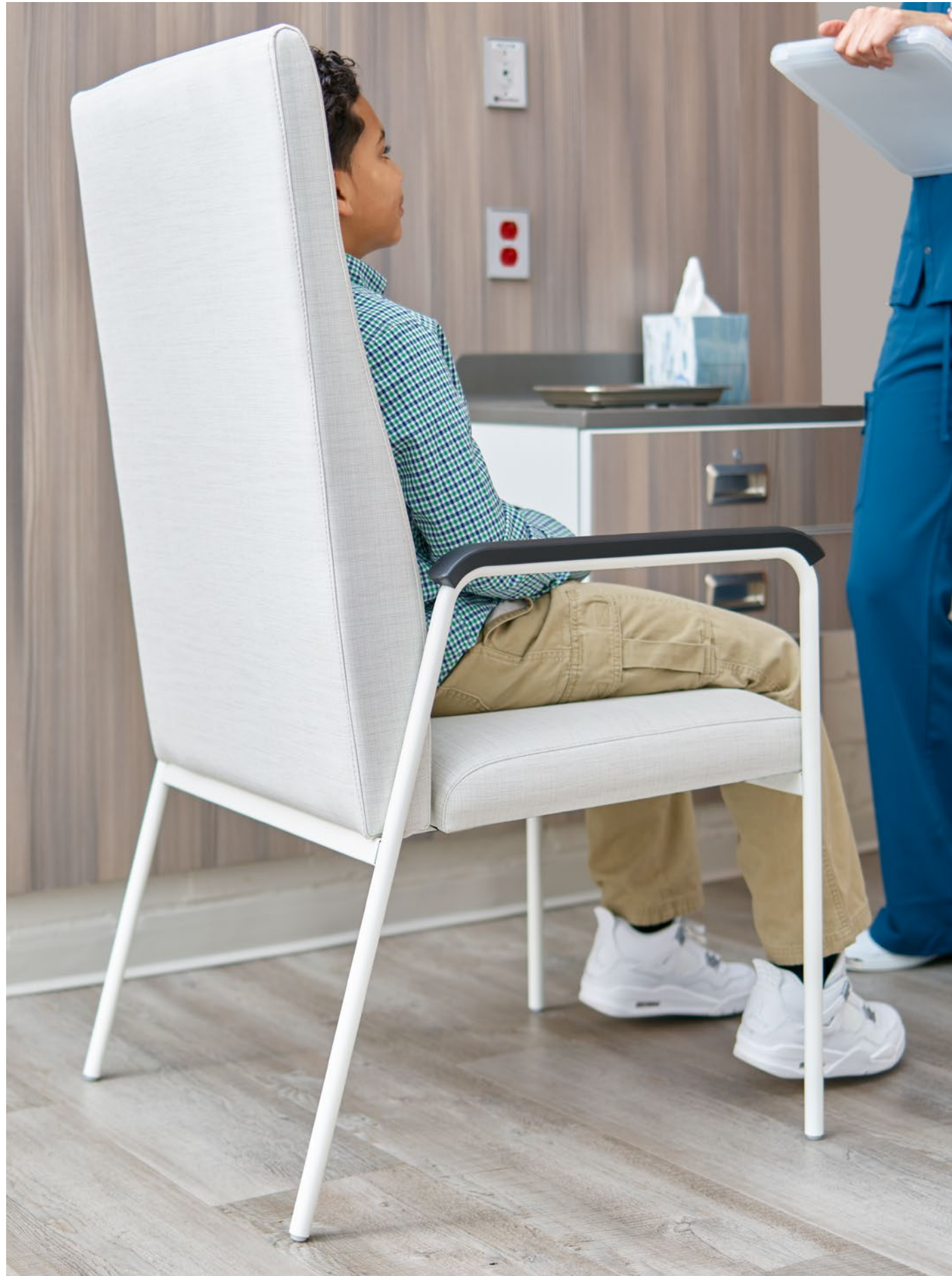
Rule of Three patient seating featuring black resin arm caps with Mile Marker casegoods