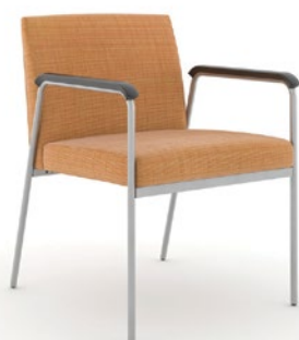
Black resin arm cap