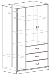
Storage cabinet, left hinged LG-W7144LSC w44" d24.75" h71.25"