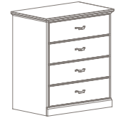
Dresser, four drawers LG-W3421DR w33.75" d21" h38.25"