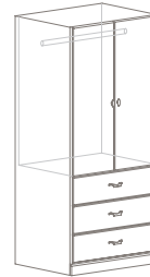
Storage cabinet LG-W7132SC w32" d24.75" h71.25"