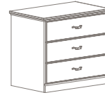
Dresser, three drawers LG-W3421DR w33.75" d21" h30"