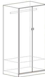
Wardrobe LG-W7136WD1 w36" d24.75" h71.25"