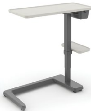
3DL top, C base