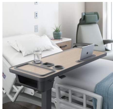
Device and drink holders