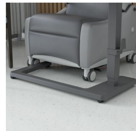
Low profile, Shadow grey powder-coated steel column and C base