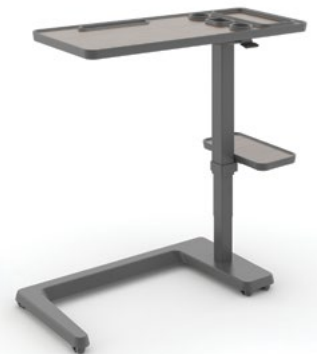
HPL top, C base