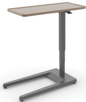
3DL top, U base