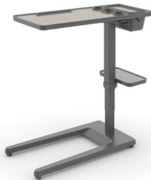
HPL top, U base