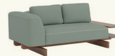
SF2463 2-seater sofa with upholstered seat, backrest and right arm. Base and left side table made of solid iroko wood. The sofa comes with back cushions (x2 units).