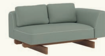
SF2464 2-seater sofa with upholstered seat, backrest and right arm. Base and left side table made of solid iroko wood. The sofa comes with back cushions (x2 units).